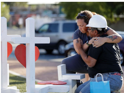
Pictured: Las Vegas residents hug in front of a memorial of wooden crosses.

We ask that you continue this example of kindness and openness and keep victims' families and those still recovering in your thoughts and prayers.