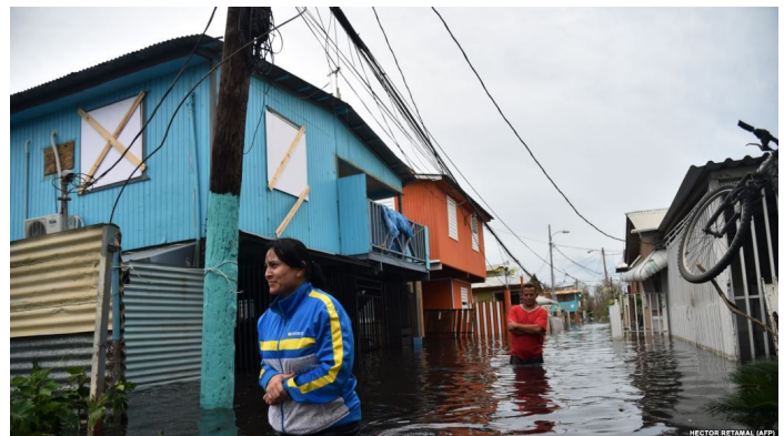
Puerto Ricans walk in the flooded streets after Hurricane Maria.