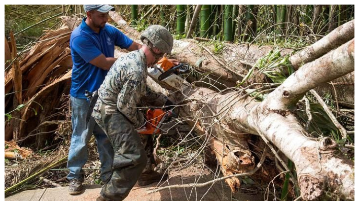
The National Guard performs relief efforts after the devastation in Puerto Rico.